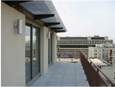
Mather Loft Condominiums Washington, DC

General Contractor Providing Quality Service is our Priority