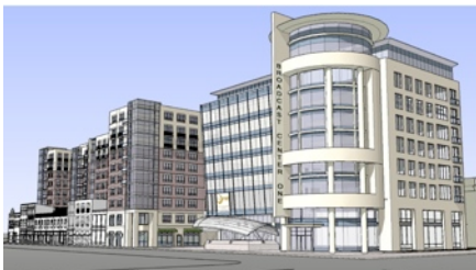
Broadcast Center One Washington, DC