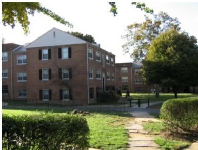
Mayfair Mansions Renovation Washington, DC