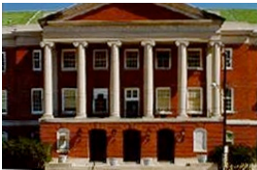
Coolidge Senior High School Washington, DC